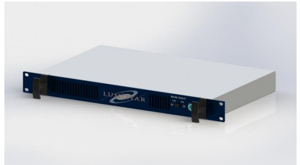
LS-16 Series Multicoupler, Front View