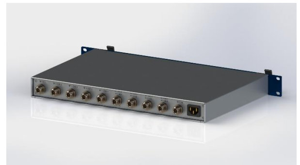
LS-16 Series Multicoupler, Rear View