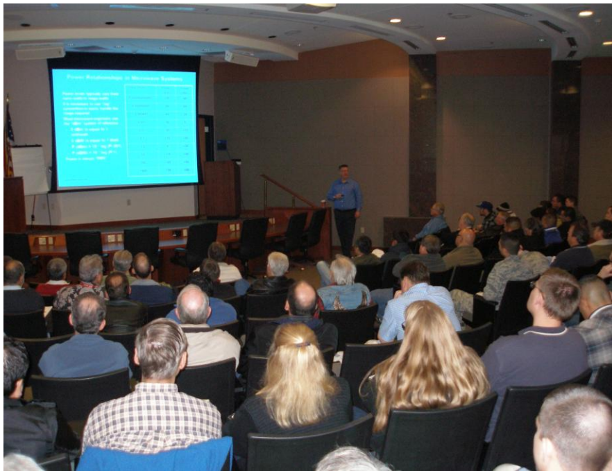
International Telemetry Conference, 2005 (Las Vegas, NV) www.telemetry.org